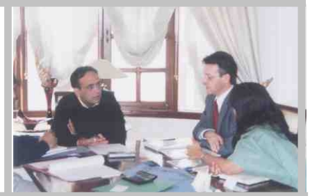
OEM supplier from Switzerland

With state of the art designs and technology from Europe , established manufacturing facilities spread out in various locations all over India & Asia and sales located in New Corporate Region (NCR) of Delhi, the Italy based company is dedicated to supplying the latest in Cryogenic Technology constantly striving to improve its products through continuous research and development.