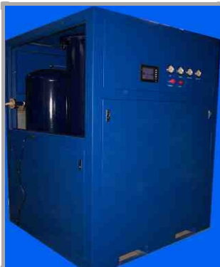
CABINET TYPE OXYGEN GENERATOR